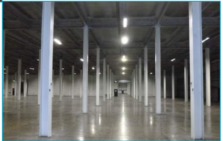
31A Lower Level