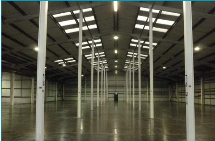
31B Upper Level